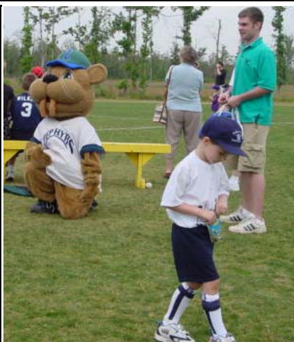
New Orleans Zephyrs mascot Boudreaux visits Pelican Park during opening day ceremonies for Baseball/Softball season.

Recreation District #1's Board of Commissioners has granted Mandeville Soccer Club (MSC) "exempt" status at the Park. This "exempt" status saves MSC over $18,000 per year. Up until the "exempt" status was granted in 2000, MSC paid the direct cost of field lighting and field painting for game use. "Exempt" status is granted to large non-profit organizations within the District that, if they did not exist, the Recreation District would have to provide that sport.