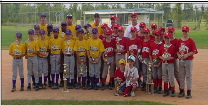
Above: Winners of the Slamfest Tournament 10 year old age group from left to right: 2nd place winners – St. James All-Stars. 1st place winners – Mandeville Bandits.